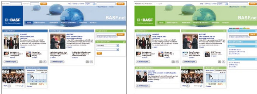
Figure (from left to right): Homepage in the standard design; homepage with personalized user settings.

As a leading chemical company, the BASF Group stands for innovative, global enterprise communications. The global intranet project BASF.net was launched amid high demands on state-of-the-art technology and CI-oriented design. For the core team at BASF, the main priority was to provide a platform designed to serve the global exchange of knowledge and information among more than 97,000 users within the BASF Group.