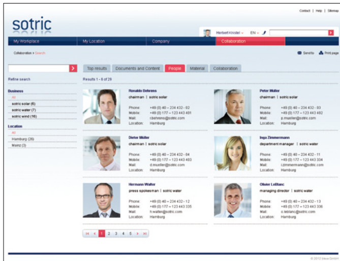
Figure: Searching for employees with btexx universalSearch

Google & Co. are the tools of choice when searching for information on the Web. Now you can offer the convenience of these tools in your enterprise portal with proven SAP NetWeaver Portal standards.