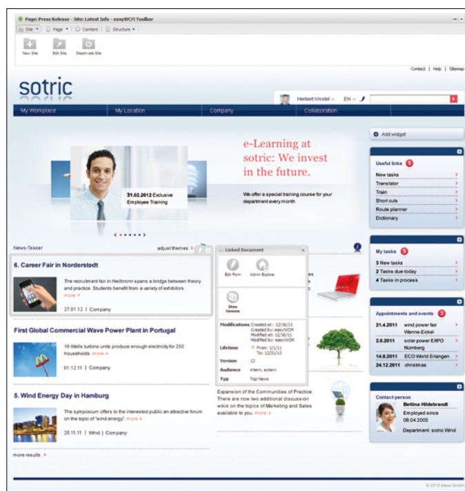
Figure: btexx easyWCM – view in editor mode

A key factor in the success of modern intranets, Web sites or service portals is sophisticated Web Content Management. This is only possible if editors have access to intuitive tools and technologies that enable them to easily create dynamic content.